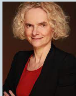
NORA VOLKOW (NIDA, USA) Update on Prevention and Treatment of Dual Disorder