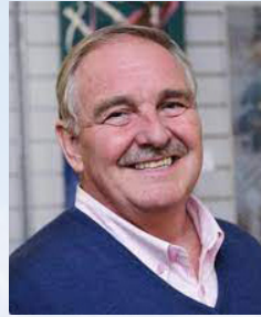
DAVID NUTT (London, UK) Psychedelics in the Treatment of Dual Disorders: Addiction and Other Mental Disorders